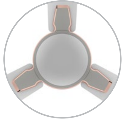
Pearl White Titanium