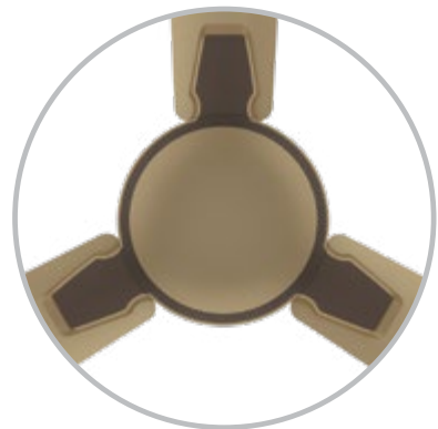
Birken Effect Brown